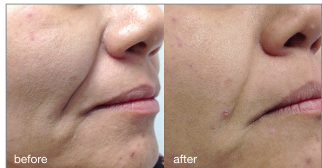
Fotona4D® procedure: courtesy of Adrian Gaspar, MD

A light cold Er:YAG ablation that gives a pearl finish to the skin. SupErficial™ additionally improves the appearance of the skin and reduces imperfections by using propriety VSP technology, enabling the operator to easily adjust the laser to an extremely controlled light peel, without thermal effects, for a no-down time, precise treatment.